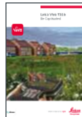
Leica Viva TS16