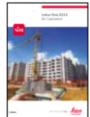
Leica Viva GS15