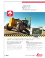
Leica ConX Flyer