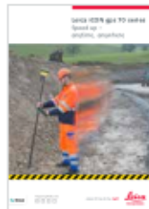
Leica iCON gps 70 Series Broch

Illustrations, descriptions and technical data are not binding. All rights reserved. Printed in Switzerland - Copyright Leica Geosystems AG, Heerbrugg, Switzerland, 2020. 818210en - 08.20