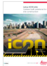
Leica iCON site Brochure